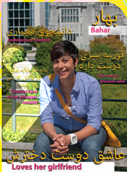
Design by: Behshid Foadi Editing by: Willow Kasprzyk